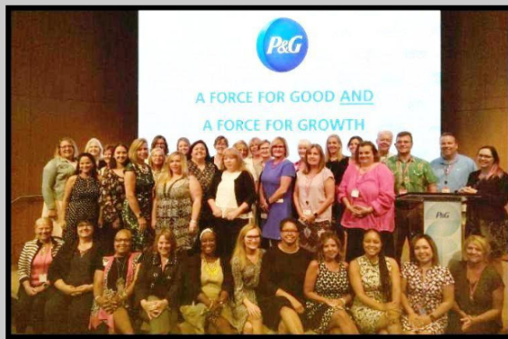
Cincinnati July WBE Forum Luncheon hosted & presented by Procter & Gamble

The WBE Forum Quarterly Luncheons are an opportunity to get engaged and build relationships with other WBEs and corporate members across the region. Contact the WBE Volunteer Chair(s) nearest you for more info. CLICK HERE to download 2018 Quarterly WBE Forum Luncheon Schedule (all dates are subject to change).